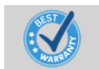
BEST WARRANTY IN THE INDUSTRY